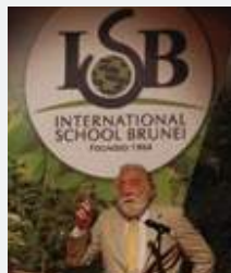
Guest Speaker for 2007 Professor David Bellamy Conservationist, Author, Television Presenter and Environmentalist United Kingdom (1940 - 2011)