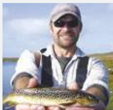
Guest Speaker for 2008 Monty Halls Television Celebrity, Best-Selling Author, Motivational Speaker and one of UK's leading Explorer United Kingdom